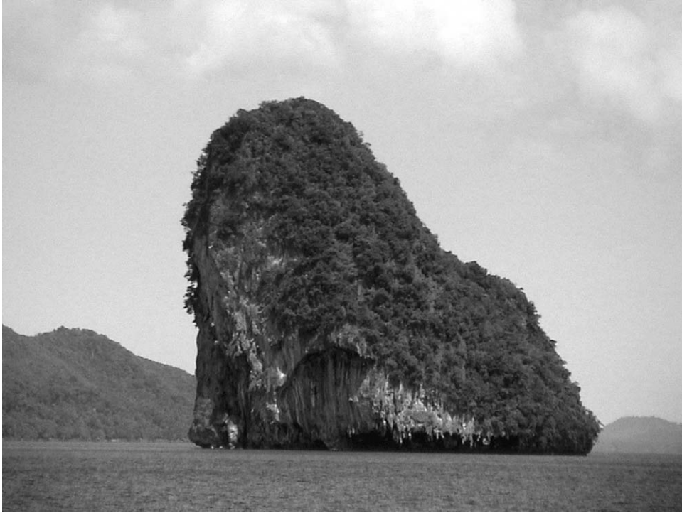
Figure 2. Typical karst island in Ao Phangnga.

Canoe and Siam Safari emphasizes the authenticity of spatial settings. Nevertheless, the communicative staging of natural authenticity in Phuket shares many parallels with the staging undertaken in northern Thailand. For example, the images created by ecotourism companies replicate several of the tropes of authenticity identified by Cohen (1989): primitiveness, naturalness, remoteness, and timelessness. In Phuket, the close proximity between mass tourism resort areas and ecotourism sites such as Ao Phangnga and small forest tracts in central Phuket complicates efforts to communicate geographical remoteness, but operators succeed both in fostering a sense of isolation from other tourists, and in communicating the natural authenticity of primitive, pristine, and unspoiled locations far from mass tourist 'hordes'. Siam Safari, for instance, promises in its promotional brochures to take people 'far from the tourist crowds' to 'another world – The Real Natural Thailand'. A major element of Sea Canoe daytrips also revolves around communicating authenticity and conveying to tourists a feeling of discovery and exploration of 'untouched' caves, lagoons, and mangrove forests; this is a task that is made difficult but necessary by the staggered presence of hundreds of tourists a day. In its brochure, Sea Canoe assures potential customers of the natural and historical authenticity of its locations: