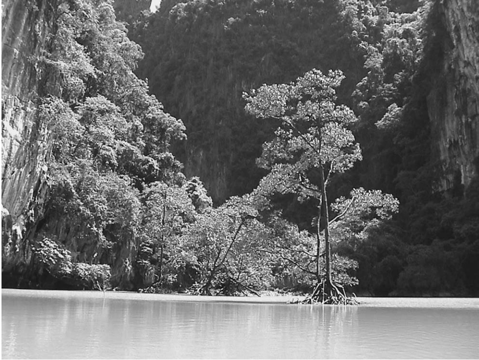
Figure 3. Enclosed inner lagoon ('hong') of an island in Ao Phangnga.

clearly succeed. Considering Phuket's small size (210 square miles) and the spatial proximity of uninhabited forested areas to congested beach and urban locations, this successful communication of natural authenticity is a testament to the skill of Siam Safari's guides.